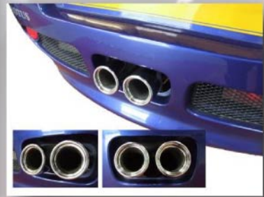
More power throughout +6 bhp @ 7100 rpm & +3 ft-lbf @ 7100 rpm