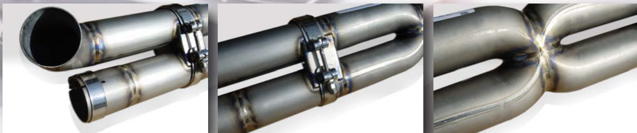
The Titanium welds achieved on this QuickSilver System are exceptionally smooth and clean.