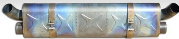
Original System 5 kg (11.0231 lbs)